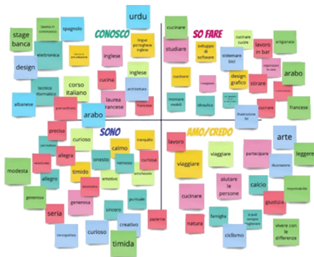
Figura 1. Talent map example